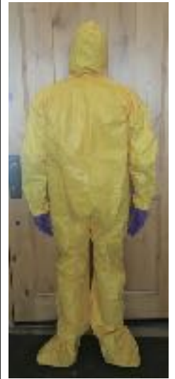
Demonstration photo of part of medical protective gear

Our firefighters and medical first-responders are there for you, please be there for them. Thank you!